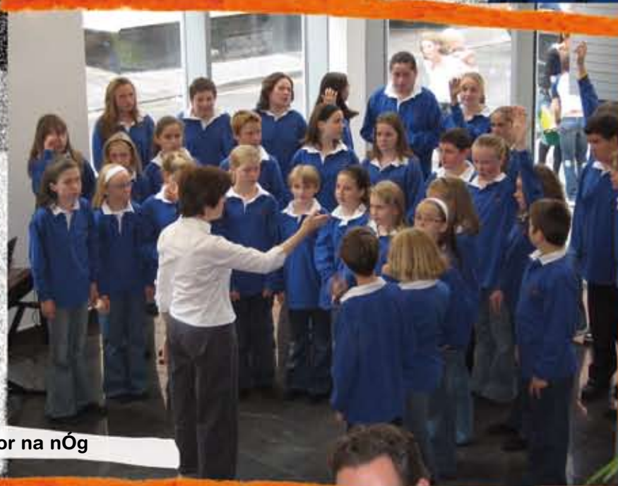
RTÉ Cor na nÓg

The OCO's great new office was officially launched by President Mary McAleese in September 2005. Hundreds of children and young people attended the celebrations and were entertained by the enormously talented young people from RTÉ Cor na nÓg, Whiz Kids from Ma Samba and Comhaltas Ceoltoiri Eireann.