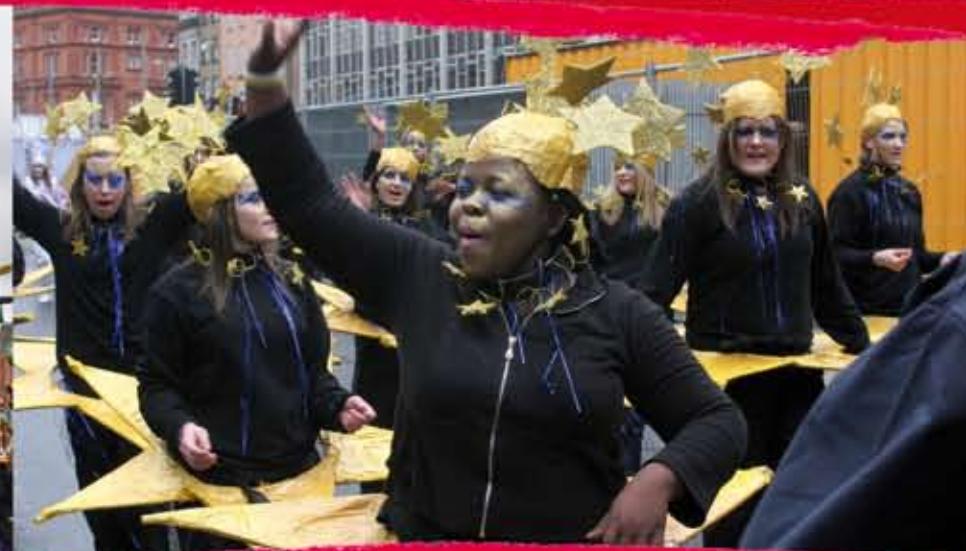
Brighter Future's Transition Year Project, St Patrick's Parade