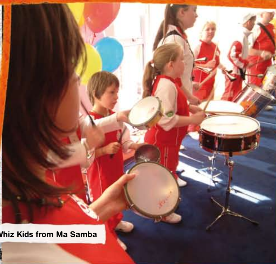
Whiz Kids from Ma Samba