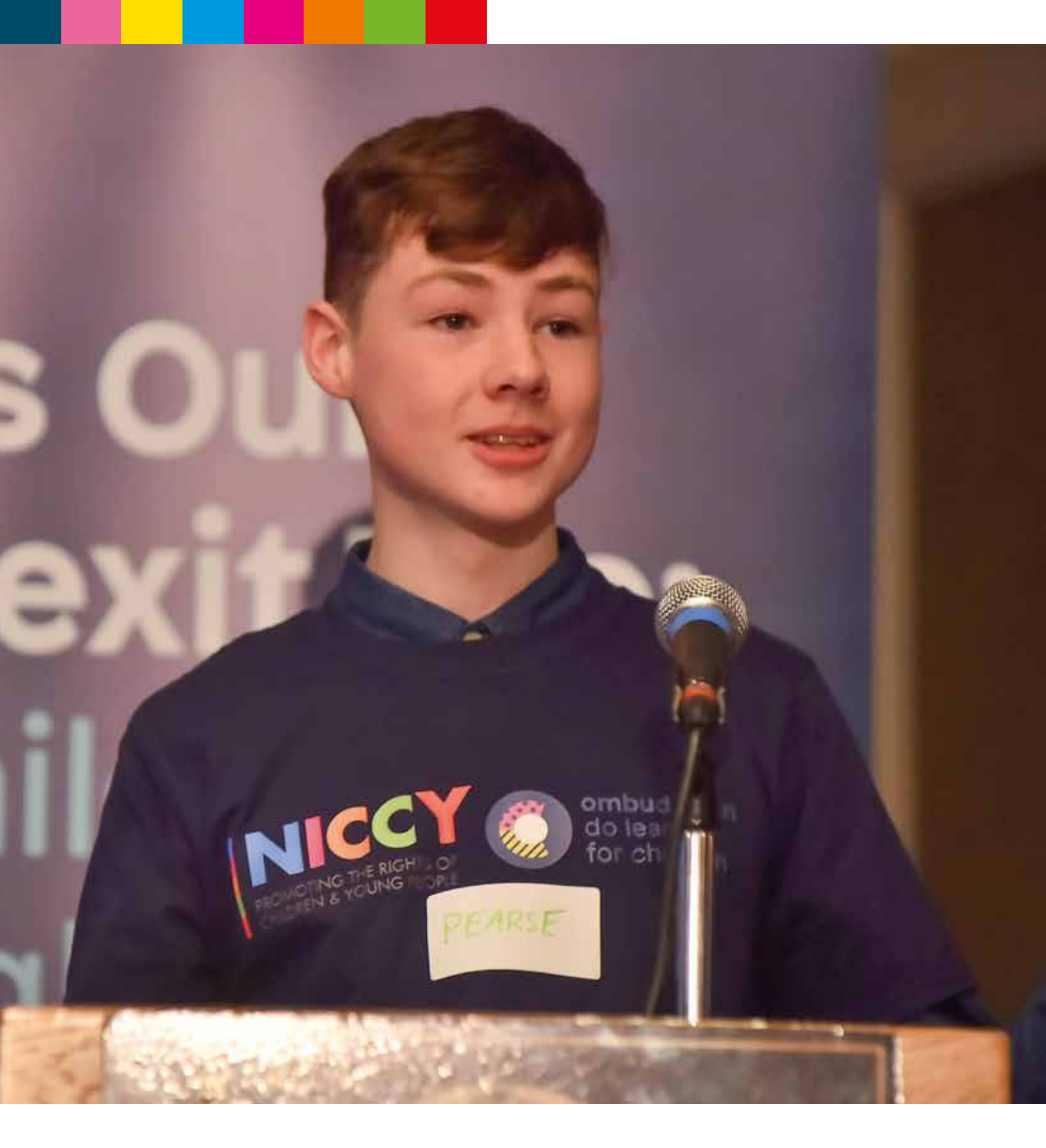
PART 1: HEARING FROM YOUNG PEOPLE